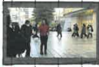
Tempo tissue - Kubari, 2024 video 10 min loop

Sound princess (pee) Sound princess for peeing